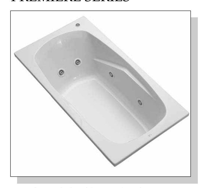
Canterbury Whirlpool (015-0025). Bath waste not included.