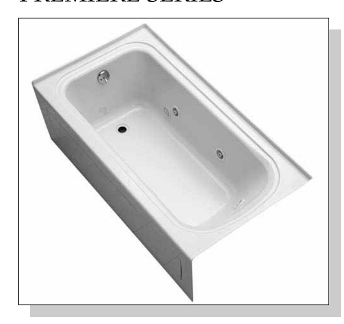
Patriot Whirlpool (015-0109) with Integral Skirt. Bath waste not included.